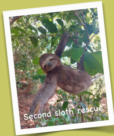
Second sloth rescue